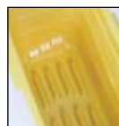
Features molded-in drain ribs and liquid fill levels.