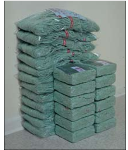
Web Foot® Compact Mops require less storage space!