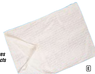
Mesh bag minimizes tangling and protects mop heads during laundering.