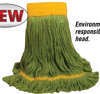
Environmentally responsible mop head.