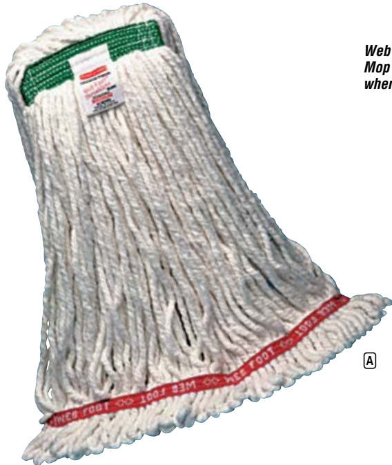
Web Foot® Compact Mop expands to full size when put into service.